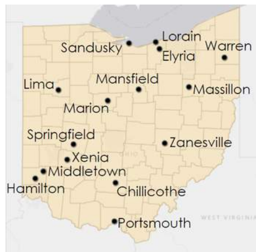
Ohio's Reinvention Cities

In 2000, small legacy cities began in a stronger economic position than their large or mid-sized counterparts. But by 2016, they had experienced the greatest overall declines in their economic health. Small legacy cities saw the size of their workforces drop dramatically, even as they grew in Cleveland and Cincinnati. Today, the share of adults in small legacy cities who are working or actively looking for a job is 6 percentage points behind the state average and nearly 13 percentage points behind Columbus. Poverty growth in small cities has also outstripped that of their larger counterparts.